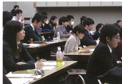
Life Insurance Forum

We have sponsored the OLIS-Prudential-Gibraltar Life Insurance Endowed Course at Keio University since 2010 and at Chuo University since 2014. We aim to provide students with opportunities to further develop their knowledge about life insurance and nurture human resources for the life insurance business in the future.